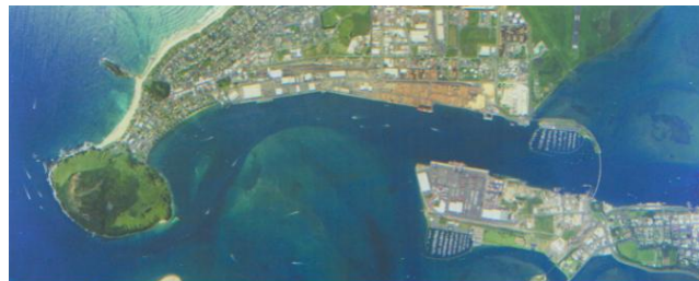
Vertical Photo of the Port of Tauranga and Mount Maunganui