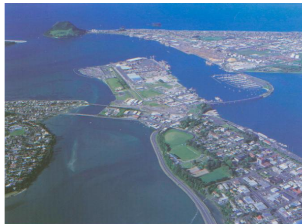
Oblique photo of the Port of Tauranga and Mount Maunganui.