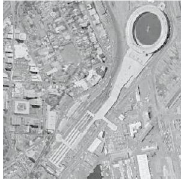
Wellington Railway Station and WestpacTrust Stadium

The two main types of Aerial photographs are oblique (taken from an angle) and birds eye view/vertical (taken from directly above).