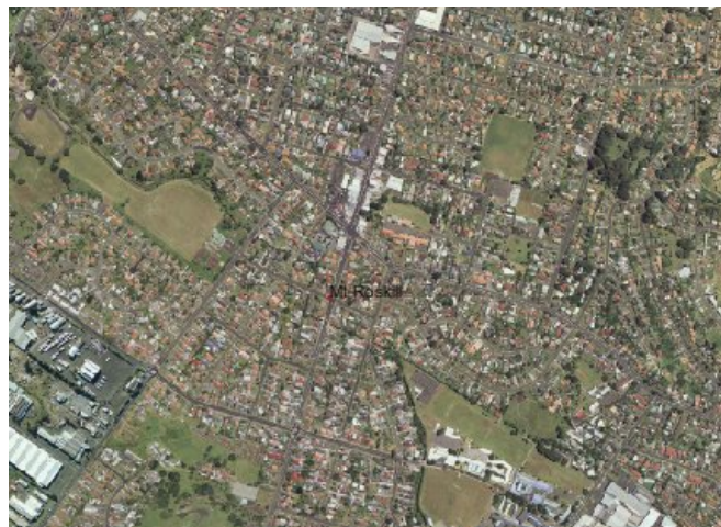
Mt Roskill 2001

These two vertical photos have been taken of Mt Roskill, one in 1940, the other in 2001. The photos are taken at different heights, but generally show the same area. What was Mt Roskill like in 1940? - rural area, lots of open space (possibly paddocks/farmland), some houses on main road. What was Mt Roskill like in 2001? - large built-up area, no paddocks left, some smaller areas of grass (probably parks and sports fields)