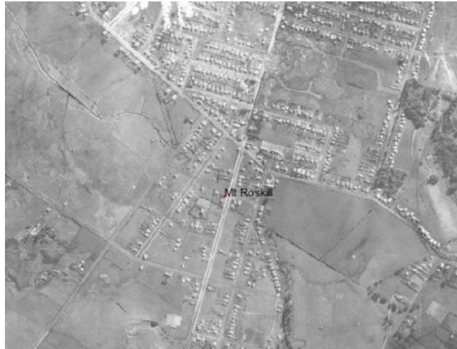
Mt Roskill 1940

These two vertical photos have been taken of Mt Roskill, one in 1940, the other in 2001. The photos are taken at different heights, but generally show the same area. What was Mt Roskill like in 1940? - rural area, lots of open space (possibly paddocks/farmland), some houses on main road. What was Mt Roskill like in 2001? - large built-up area, no paddocks left, some smaller areas of grass (probably parks and sports fields)