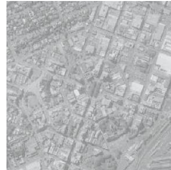
City Centre, Dunedin